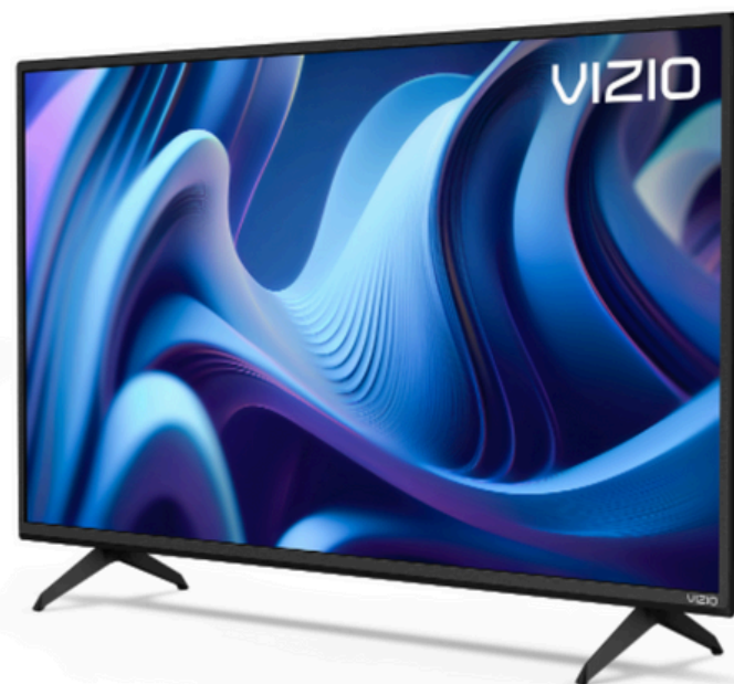
40 inch Vizio Flat Screen TV

We're hosting a simple and fun fundraiser for February!